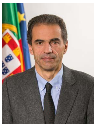
Manuel Heitor Minister of Science, Technology and Higher Education, Portugal

Between 2011 and 2015, she was Deputy Mayor and Councillor for Dynamisation, Economics, Trade and Tourism at Igualada Town Council. During this same period, she coordinated the URBACT 3D Cities project on economic growth and innovation in the health sector. Later on, she would coordinate another URBACT project, Retailink, on retail innovation in mid-sized cities. In regards to her professional career in the private sector, in the years leading up to 2011, she worked for different companies in the paper industry, as well as managing the Anoia Business Union from 2008 to 2011.